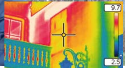
A former window - closed with bricks or plaster of a better quality